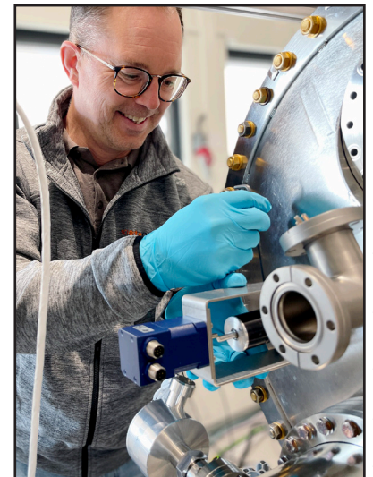
One of our service engineers installing the PEAK Slit Control to an ARPES Lab. Quick installation with no need for breaking vacuum.

The PEAK Slit Control upgrade includes a motor assembly with stepper motor, a motor control box, the dedicated software license for the PEAK, Scienta Omicron's electron spectroscopy control and acquisition software.