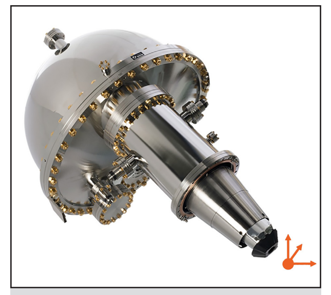
Fig. 1: The DFS30, the new standard for angle resolved photoelectron spectroscopy, is equipped with Electrostatic 3D Focus Adjustment. Real time calculated lens tables allow to adjust and shift the analyser focal point to the emission spot on the sample, ideal for small spot \mu ARPES measurements.

Electrostatic 3D Focus Adjustment technology (patent pending) introduces dynamic lens tables generated in real time for deflection, angular, and transmission modes. The analyser's focal point is conveniently shifted in X, Y, and Z (working distance) to the photoelectron emission spot using software sliders. This replaces imprecise mechanical movements of sample and photon source with electronic precision and repeatability. The emission spot can now remain static on the region of interest, not risking to lose this position, while optimising for best measurement conditions. This significantly improves the workflow, speed, and reproducibility (see Fig. 2 on next page) saving hours of alignment time. This leads to preserved sample surface quality and effective sample lifetime for measurements.