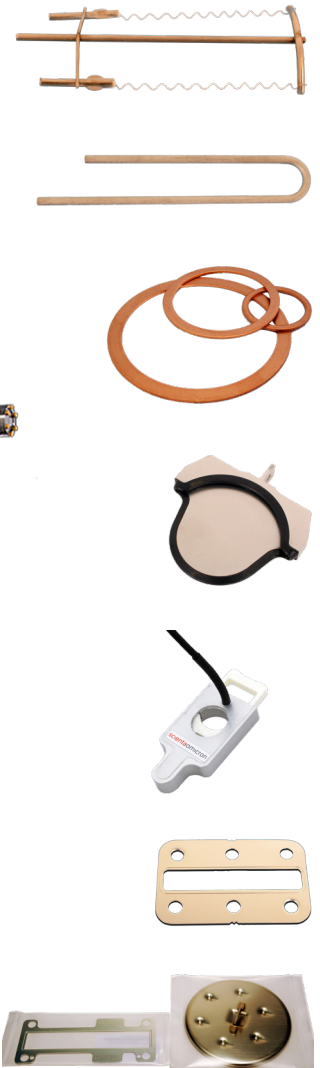
The High Uptime Kit for UHV Systems